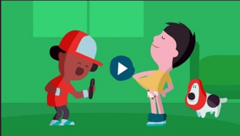
I Saw Your Willy

It can be hard to keep track of what a child is doing on social networks, apps and games. Or know how to keep them safe. That's why the NSPCC teamed up with O2 . Together they're helping parents untangle the web. And teach their children to beShare Aware.