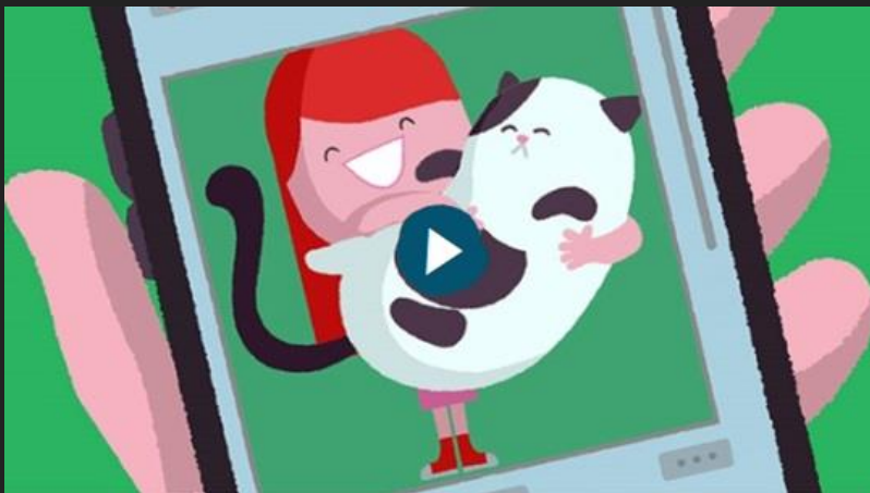
Lucy and the Boy

Because, just like in real life, kids need your help to stay safe online.